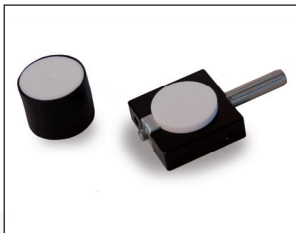
Standard sample holder