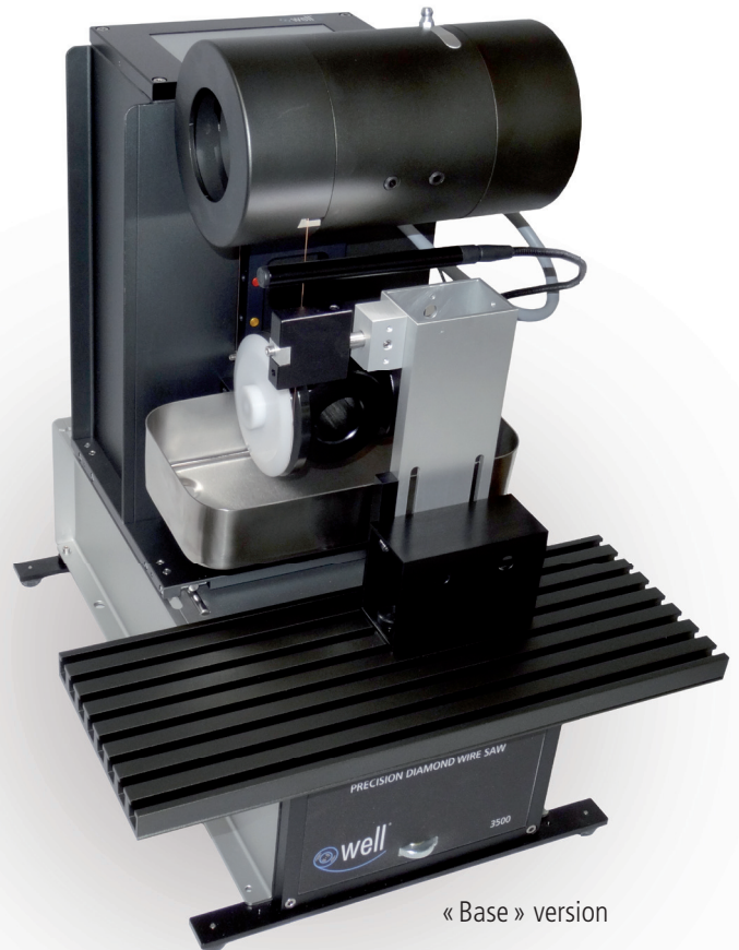
« Base » version

WELL DIAMOND WIRE SAWS believes quality is quantifiable. Our saws are designed and manufactured to help others achieve the quality results they seek - regardless of the cutting task and whether the application is for research and development, production, quality control or failure analysis.