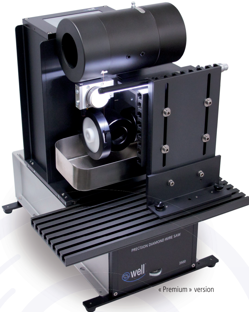
« Premium » version

WELL DIAMOND WIRE SAWS produce smooth, sharp-edged surfaces on virtually any material. The "cutting tool" employed is a stainless steel wire with diamonds embedded into the surface of the wire. This patented embedding process ensures maximum cutting capability and long wire life. The wire is wound onto a drum mounted onto a precision reciprocating motor.