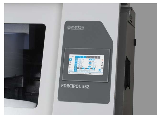
Programmable HMI touch screen controls

FORCIPOL 352 allows you to preset the amount of material to be removed very accurately. The desired grinding depth can be set from 0.01 - 3.00 mm. The vertical movement of the grinding head is motorized with digital positioning and display on the touch screen LCD. The robust design of the column guarantees high reproducibility. The material to be removed from the specimen can be preset in increments of 10 microns