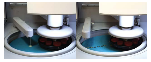
Movable Dosing Arm