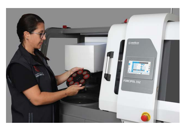
Perfectly polished and planar specimen surfaces