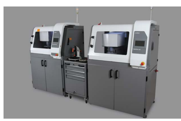
FORCI System Combination

FORCIPOL 352 offers the highest level of safety standards. The entire working are is totally enclosed. Several safety circuits guarantee optimum protection for the operator. Equipped with numerous safety features to provide maximum operator and machine safety.