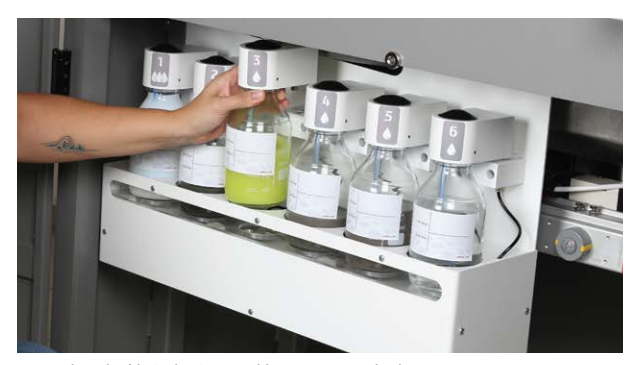
Automatic Peristaltic Dosing System with Easy Insert Mechanism

Optional Barcode Scanner allows easy and quickly loading of correct parameters for different samples. This will eliminate the risk of loading wrong programs due to operator error and increases efficiency. You can simply develop a barcode system for your each specimen on your laboratory to enable fast data entry with less errors.