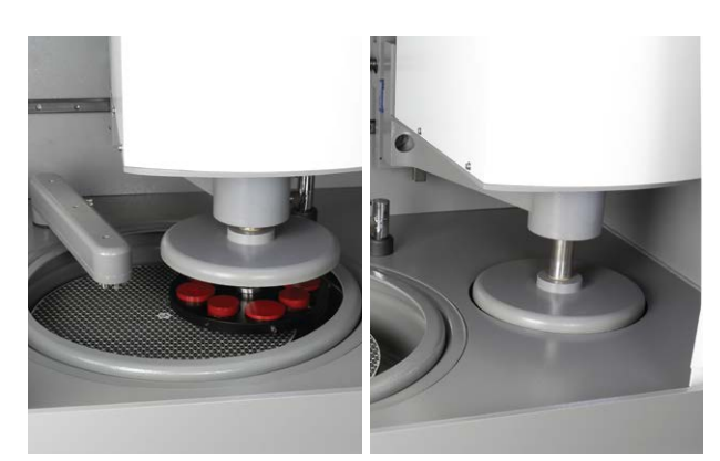
Automatic Head Movement to Cleaning Station