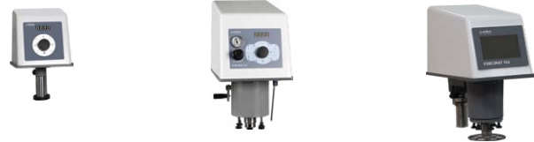
FORCIPOL CONTROL UNIT

FORCIPOL Control Unit: For Manual Operation FORCIMAT 52: For Semi Automatic Individual Force Operation FORCIMAT 102: For Programmable Automatic Individual and Central Force Operation